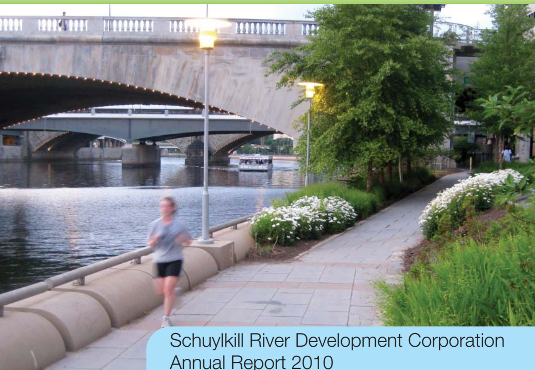
Schuylkill River Development Corporation Annual Report 2010